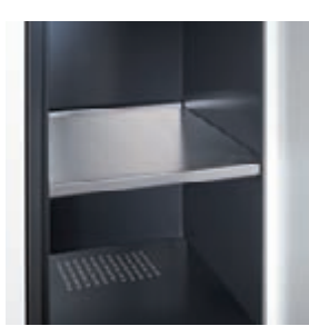
Additional shoe shelf: Installation height approx. 50 mm. Can easily be retrofitted by a non-specialist!