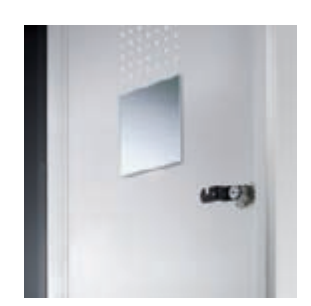
On the inside of the door, size approx. 110 x 90 mm.