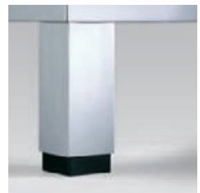
Optimal corrosion protection with feet made of plastic: They fit perfectly to the straightforward design, and they have a sleeve that covers the adjusting screw that is a standard fitting for height adjustment. A neat idea!