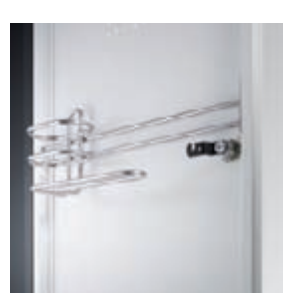
Towel / shower gel holder: Made of chromed metal for the inside of the door, available for steel and decor doors.