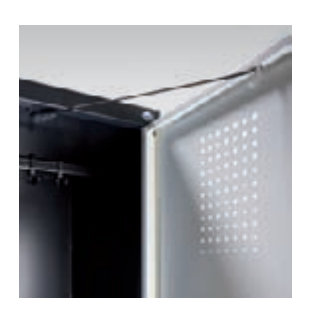
New door opening limiter 90°:

Wall mounted lockers, a variety of color combinations, different compartment sizes, open cloakroom solutions, a great many lock types and labeling systems and much more – Evolo adapts to all requirements.