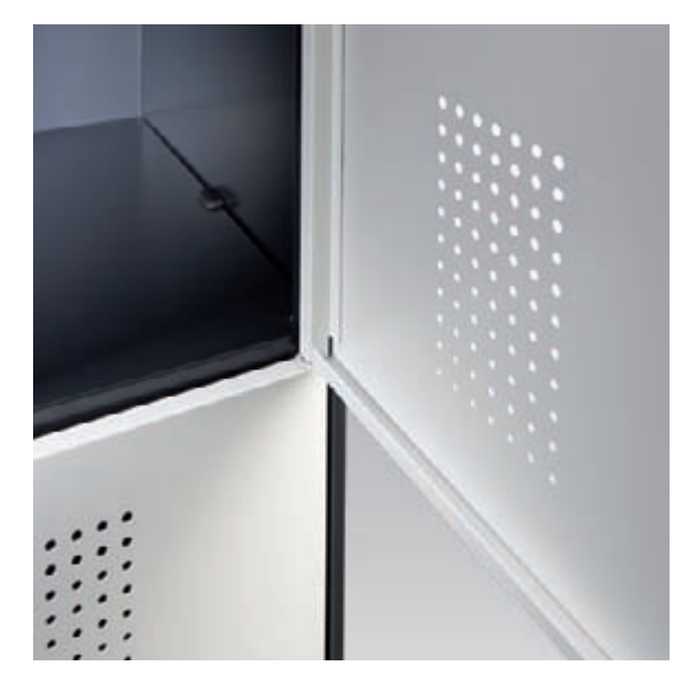
Increased anti-theft security with extremely warp resistant doors: The closed side profiles make for better stability. The doorstop silencers are fitted as standard.