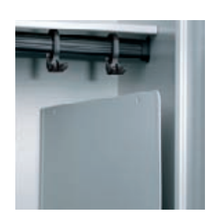
Partition below the hat shelf: Made of steel, available as swiveling or fixed version. Alternatively made of plastic, can be moved / swiveled, easy to clean.