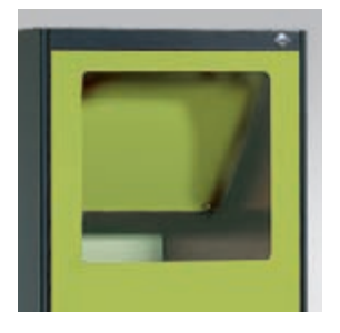
Swing flap: Laundry can be put in the collecting bin very easily.