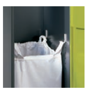
Laundry sack bracket: With four stable laundry-bag holders in the standard design.