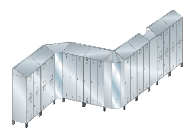
...for individual space requirements with inside corners, exterior corners, front panels, mirror face plates and many other options for creative interior planning.