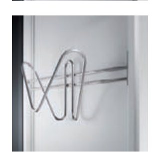
Flip-flop / shoe holder: Made of chromed metal for the inside of the door, available for steel and decor doors.